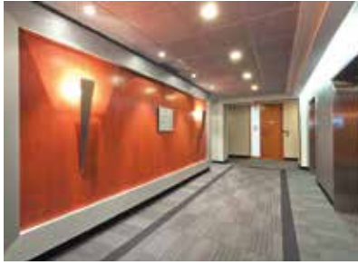
Common Area (floor)